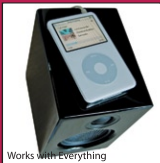
Works with Everything